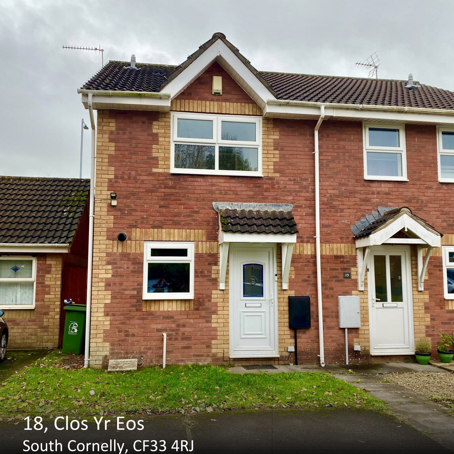
18, Clos Yr Eos South Cornelly, CF33 4RJ